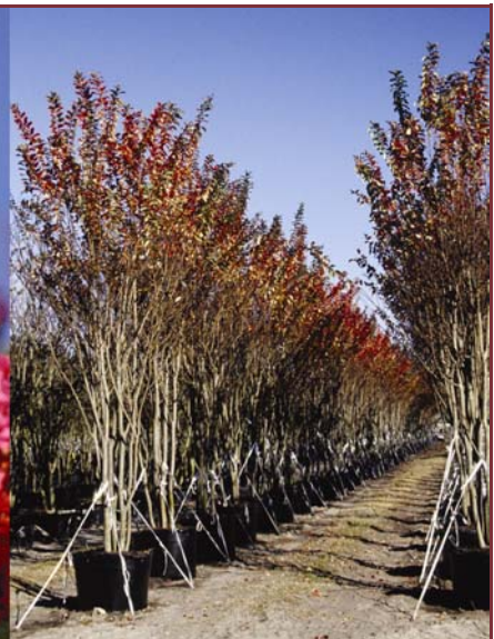
65g Tuskegee multi-trunks fall color