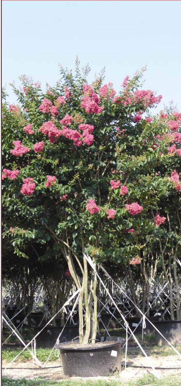
65g Tuskegee Multi-trunk

Lagerstroemia (indica x fauriei) 'Tuskegee'